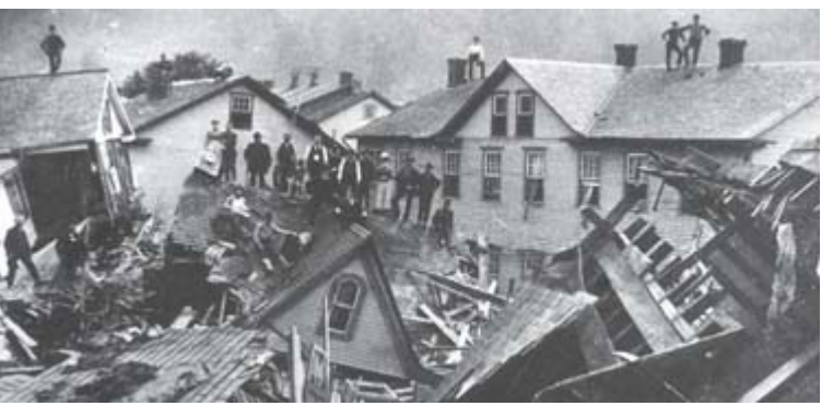
Destruction at Johnstown after the Johnstown Flood of 1889.

The Schultz house in Johnstown. 6 people were in the home at the time of the flood and all survived.