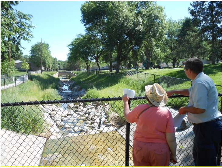
Omaha Green Infrastructure Tour participants view the Rockbrook Creek Stream Restoration Project at Prairie Lane Park in 2014

We are excited to see what our members are doing this year!